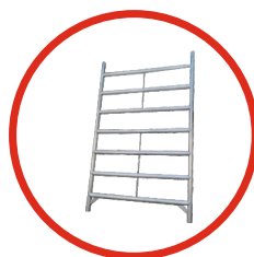
Push on Frame (1.3m) (H-2m)