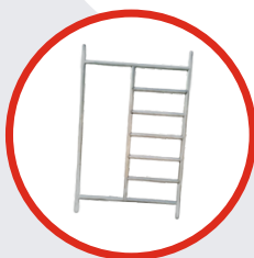
Entry Frame (1.3m) (H-2m)