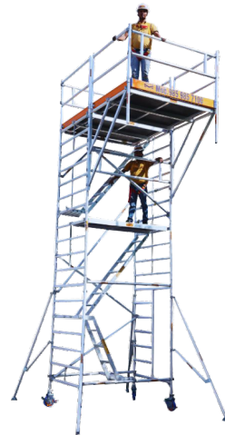
1.3m Cantilever One Side