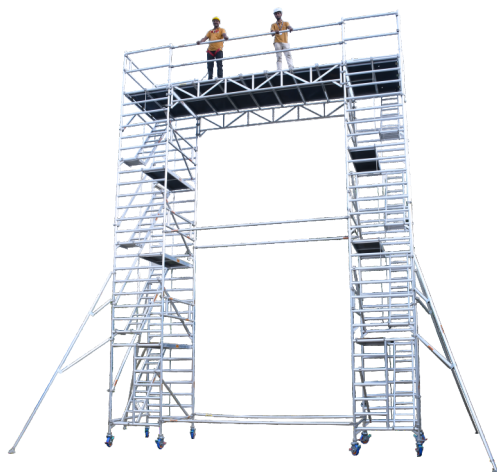
Bridge Section Available Width Sizes 2.5m, 3m, 3.8m, 4.2m, 4.8m, 5.4m, 6m