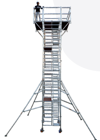
0.72m Cantilever Both Sides