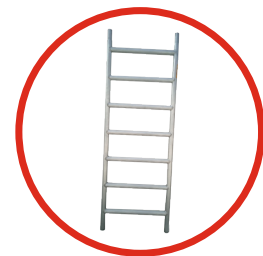
Push on Frame (0.72m) (H-2m)